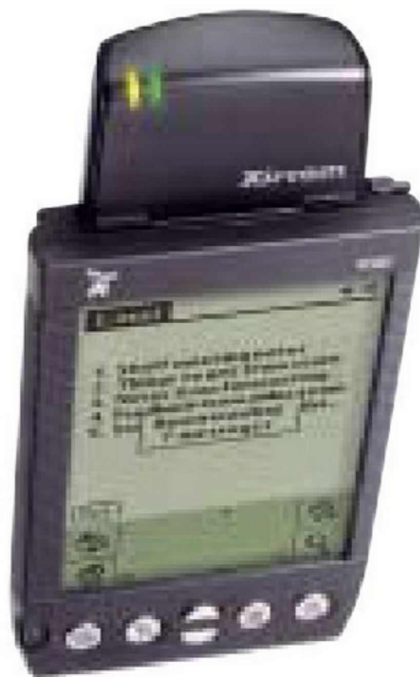
Wireless by Cisco Systems, Inc.

The Xircom one-year limited warranty guarantees your hardware and software.